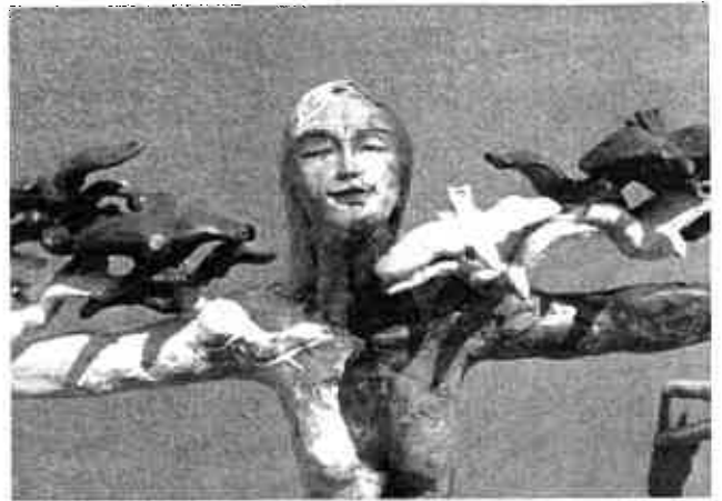
"OORVLOED" - BEELD DEUR EVETTE WEYERS