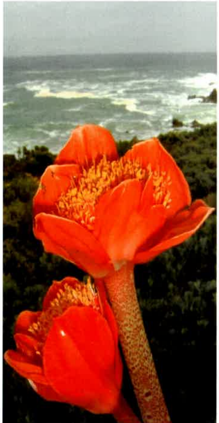
HAEMANTHUS COCCINEUS ('APRIL'S FOOL')

“...TO THE EYES OF THE MAN OF IMAGINATION, NATURE IS IMAGINATION ITSELF. AS MAN IS, SO HE SEES.”