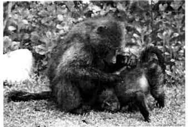
PUNT IN DIE WIND

Die mens het jare gelede in die bobbejaan se gebied kom bly, en hy het hom daarby aangepas. Evolusie het voor ons oë gebeur; die bobbejaan raak 'n dorpenaar. Hy moet nog steeds sy kos soek, en hy doen dit. Op dieselfde plek waar sy oumagrootjie en oupagrootjie, en hulle oumagrootjies en oupagrootjies voor hulle dit gedoen het. Brood en kaas lê in nuutgeverfde grotte, vrugte alles in 'n sak. Daarom reken baie mense die bobbejaan is hastig en lastig; eintlik is hy maar net besig om bobbejaan te wees.