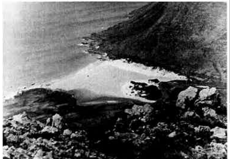
ROOIELS IN THE 1930'S BEFORE THE ROAD OR BRIDGE WAS BUILT