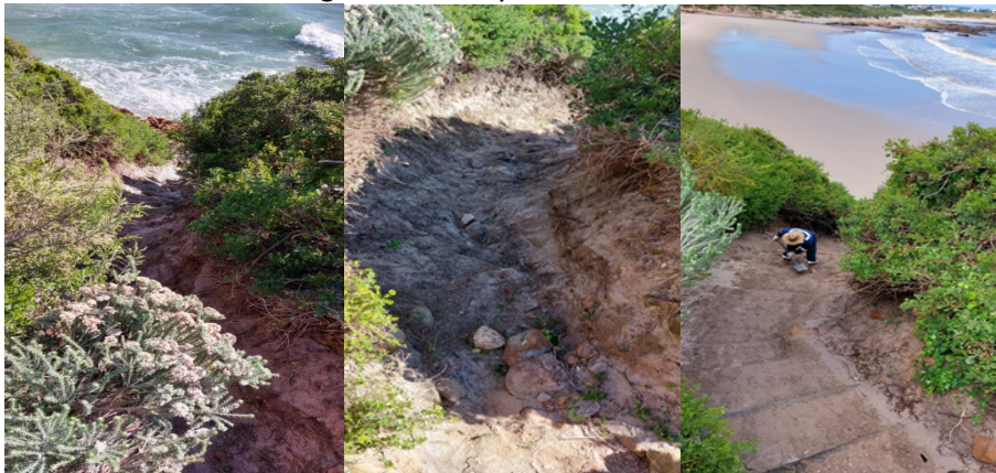
Eroded pathways on the dunes leads to wooden steps on only one pathway.

8 Municipal wheelie bins were fitted with baboon-proof locking systems and municipal signs fitted to the bins. 12 Municipal bins were fixed and marked.