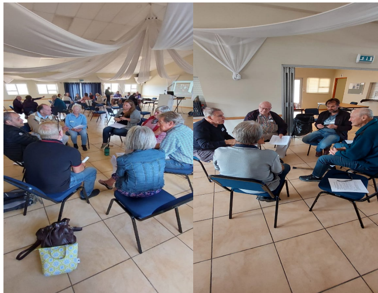
Rooielsers putting their heads together at Baboon Indaba