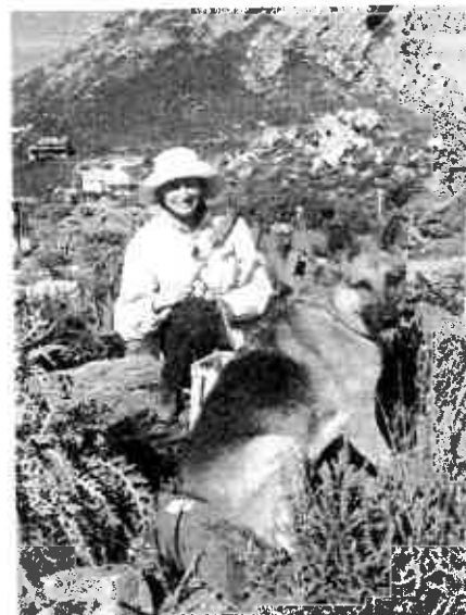
DINE & KNIBBEL 'CIRCLES IN THE FYNBOS'

PLANT YOUR GARDEN WITH INDIGENOUS PLANT SPECIES FROM THE AREA TO AVOID HYBRIDIZATION.